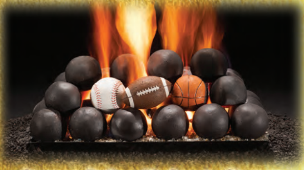
Cannon Balls with Sports Shapes