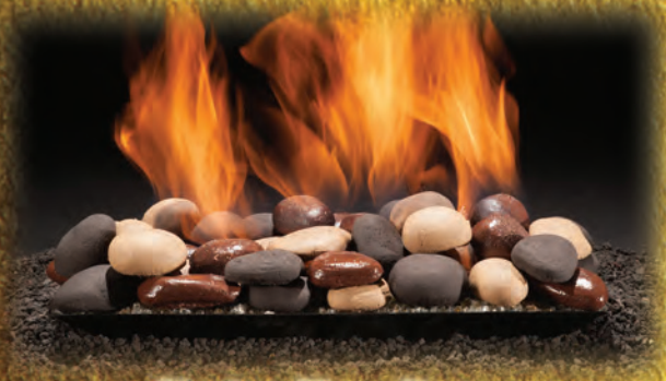
Blazing River Stones