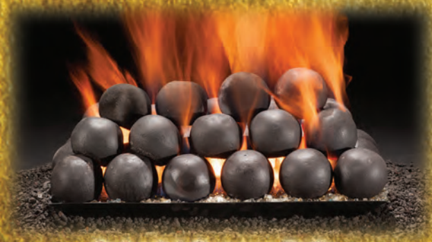
Colonial Cannon Balls

Full Pan Systems provide a stylish way to add flare to your fireplace. The low profile tray formed burner gives the elegant effect that the fire is raising out of the fireplace floor. Multiple media options are available including Fire Glass, Fire Beads, River Stones, Shapes or Gas Logs. Available in 18", 24" and 30" sizes with manual safety pilot or remote control options for Natural Gas or Liquid Propane Gas.