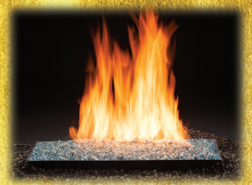
Full Pan with Reflective Blue Fire Glass

IMPORTANT: For best results fill the Full Pan Tray 2/3 of the way with Burner Pan Sand (Natural Gas) or Vermiculite (Liquid Propane Gas) then the rest of the way with Fire Glass or Fire Beads. It should take a maximum of 10 lbs. of glass to fill the remaining portion of the burner tray. More Fire Glass will be needed if you are covering the fireplace floor.