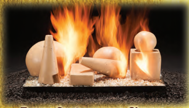
Tempo Contemporary Shapes