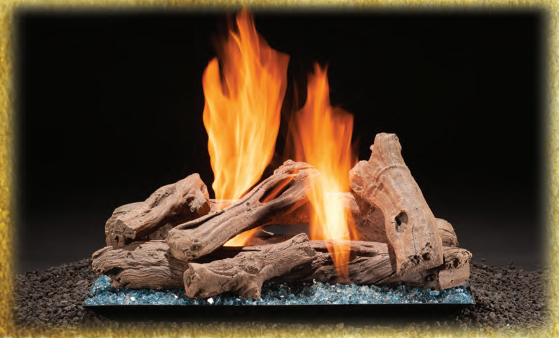
Full Pan System with Driftwood Logs and Reflective Blue Fire Glass

Full Pan Systems provide a stylish way to add flare to your fireplace. The low profile tray formed burner gives the elegant effect that the fire is raising out of the fireplace floor. Multiple media options are available including Fire Glass, Fire Beads, River Stones, Shapes or Gas Logs. Available in 18", 24" and 30" sizes with manual safety pilot or remote control options for Natural Gas or Liquid Propane Gas.